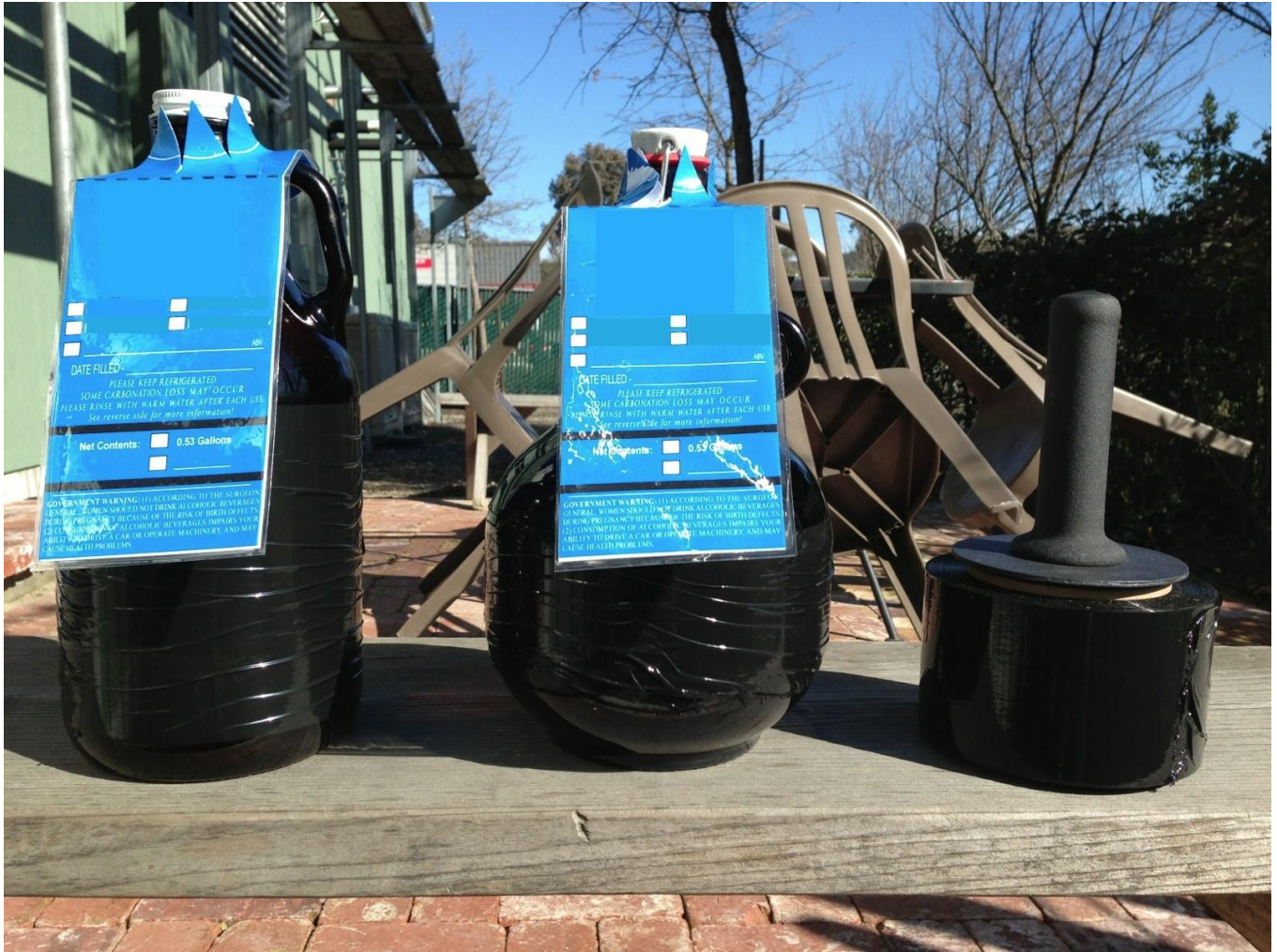
Example of growler with neck hanger and shrink wrap to obscure previous info on container. Shrink wrap dispenser at right.