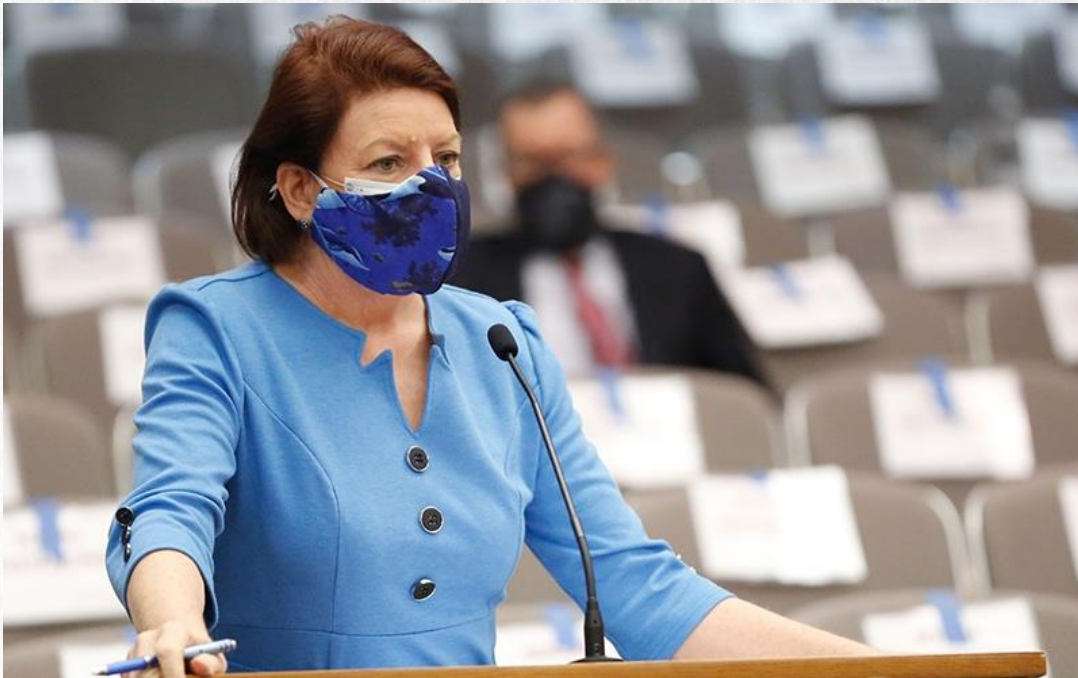
Senate President pro Tempore Toni G. Atkins (D-San Diego)