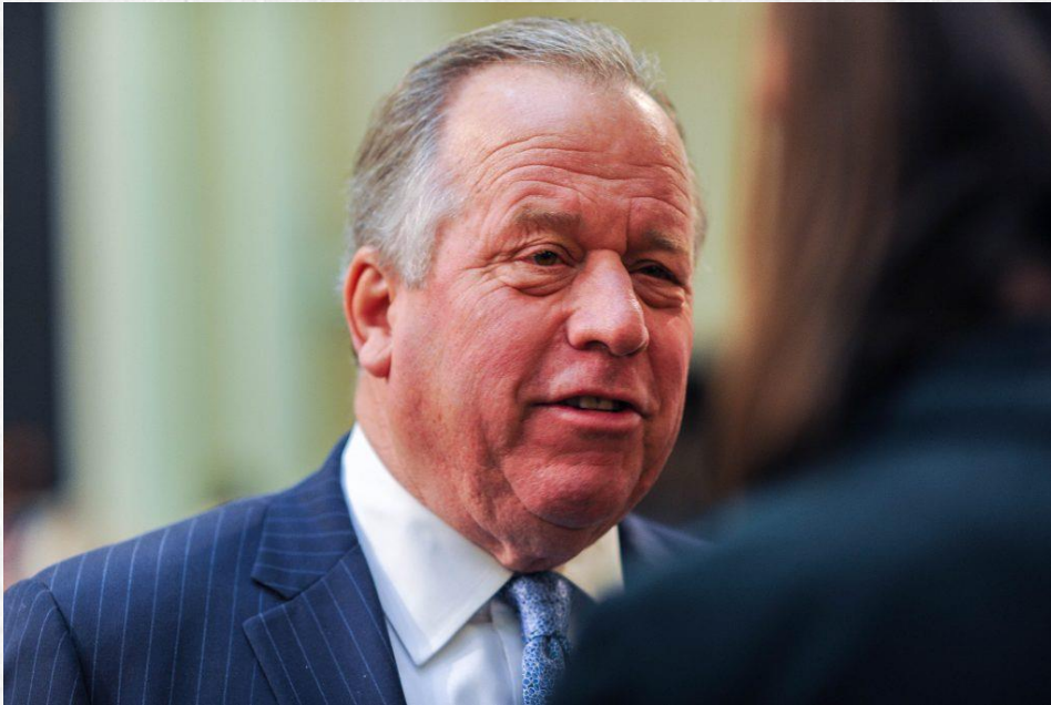
SENATOR BILL DODD Napa, Sonoma, Solano, Yolo