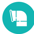
Irrigation Pump Variable Frequency Drives