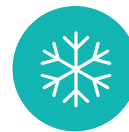
Cold Storage Fast Acting Doors