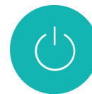
Greenhouse Heat Curtains and Controls