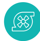
Ventilation Fan Motors and Controls